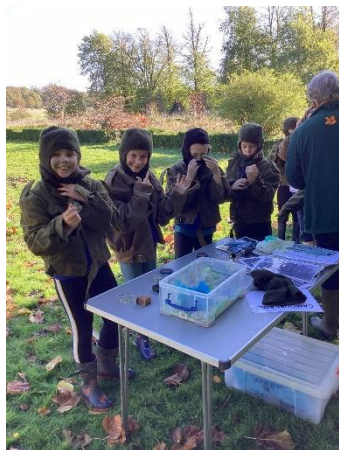
Coleshill (Class 4)

Here are some photographs of the children enjoying recent curriculum visits: