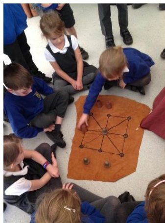
Great Fire of London (Class 2)

Thank you again to FoSS for helping off-set the costs of these enrichment activities.