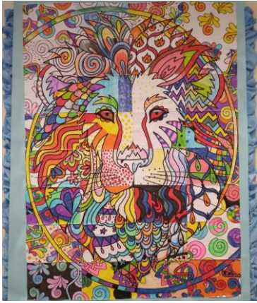
'Wellbeing Art' by Class 4