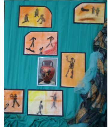
'Figurative Drawings' by Class 3