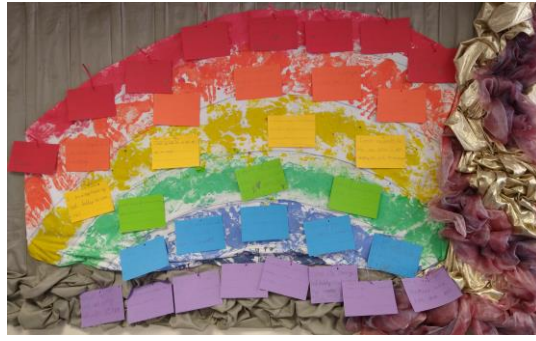
'Trust Writing' by Class 2