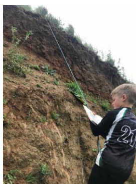
Class 3: Freddie