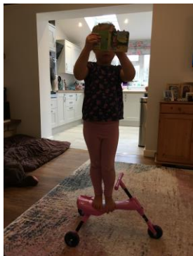
Class 1: Eva